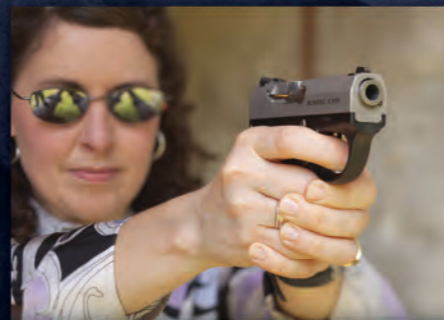
Optional light trigger pull for women