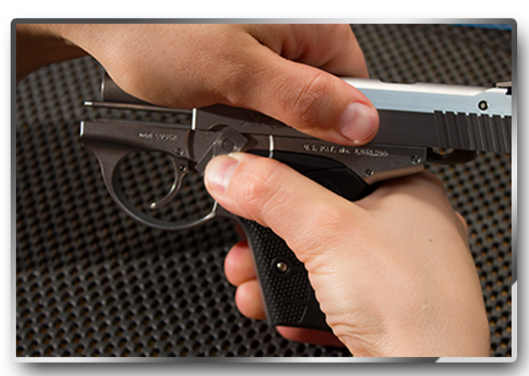
Remove slide, rotating slide release lever clockwise to the nine o-clock position.