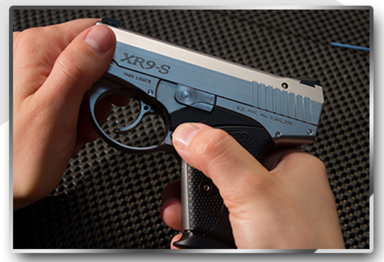
Remove magazine and clear firearm, making sure it is completely unloaded.

Wear eye protection WHENEVER working on your firearm.