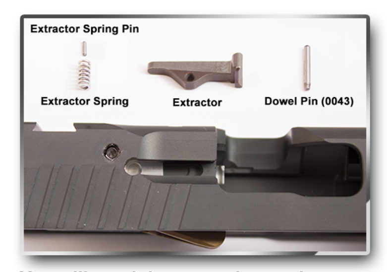
You will need the parts shown above, as well as a small amount of retaining compound (like Loctite 603).