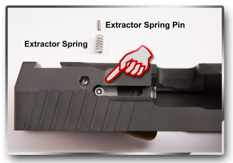
Place extractor spring and extractor spring pin in slide as shown.

Extractor - BA-000-0003 Extractor Spring - BA-000-0040 Dowel Pin - BA-000-0043