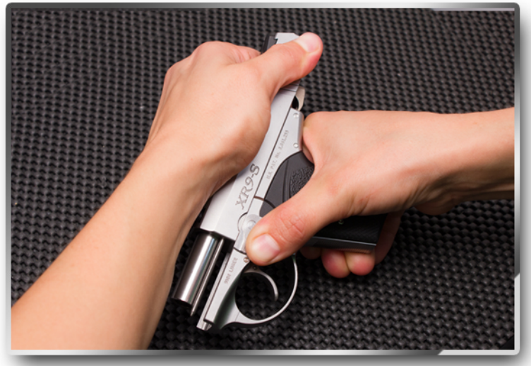
Remove slide, rotating takedown lever clockwise to the nine o-clock position.