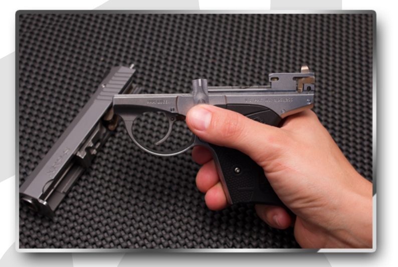
Rotate takedown lever to the 12 o-clock position.