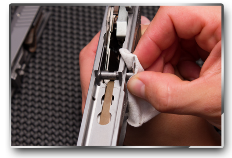
Use a fold of cloth or glove to protect fingers and rotate lever back from the 2 o-clock position to the 10 o-clock position while removing lever.