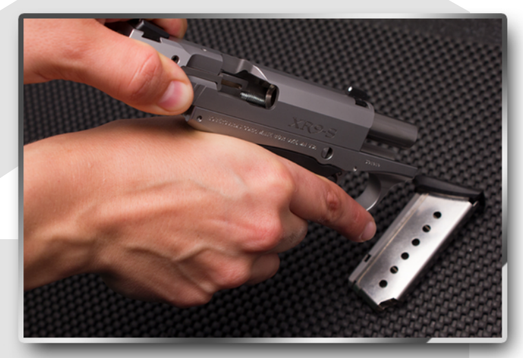
Remove magazine and clear firearm, making sure it is completely unloaded.

Wear eye protection WHENEVER working on your firearm.