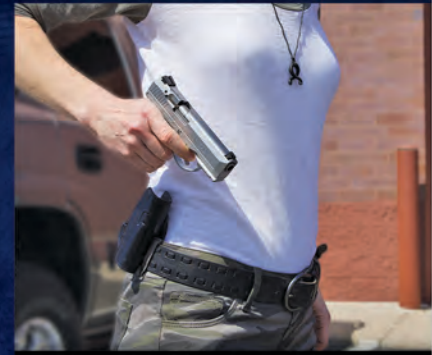
Full Size power when your life depends on it.

CALIBER 9MM OR LUGER LENGTH 5.95" (151MM) HEIGHT 4.2" (107MM) WIDTH .96" (24MM) WEIGHT 18.4 OZ (522G) BARREL LENGTH 4.2" (107MM) ACTION ROTATING BARREL LOCKED BREECH SIGHTS DIRECT WINDAGE, LOW-PROFILE, 4.6" (116.8MM) RADIUS TRIGGER PULL 7.5# (33N) (Standard) 6.0# (27N) and 9.0# (40N) (Optional) SAFETIES 2 CAPACITY 7+1 MAX ENERGY 500 Ft-lbs (678J) (Using Cor-Bon PowRball 100-gr +P JHP ammunition)