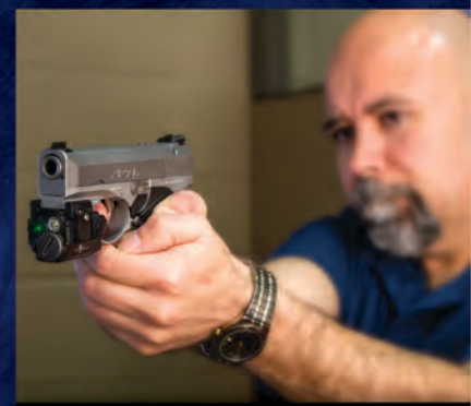
Variety of accessories available.