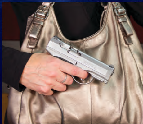
Small enough to fit easily into a purse!